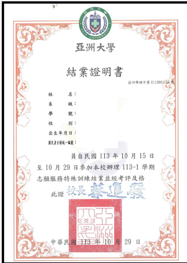
正面 Front Side